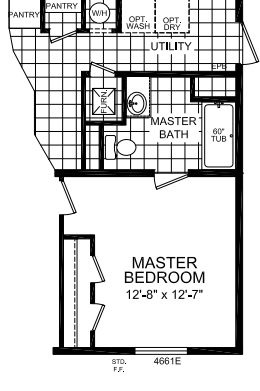
OPTIONAL REAR ENTRY