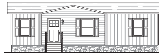
COLONIAL FRONT EXTERIOR ELEVATION TREATMENT